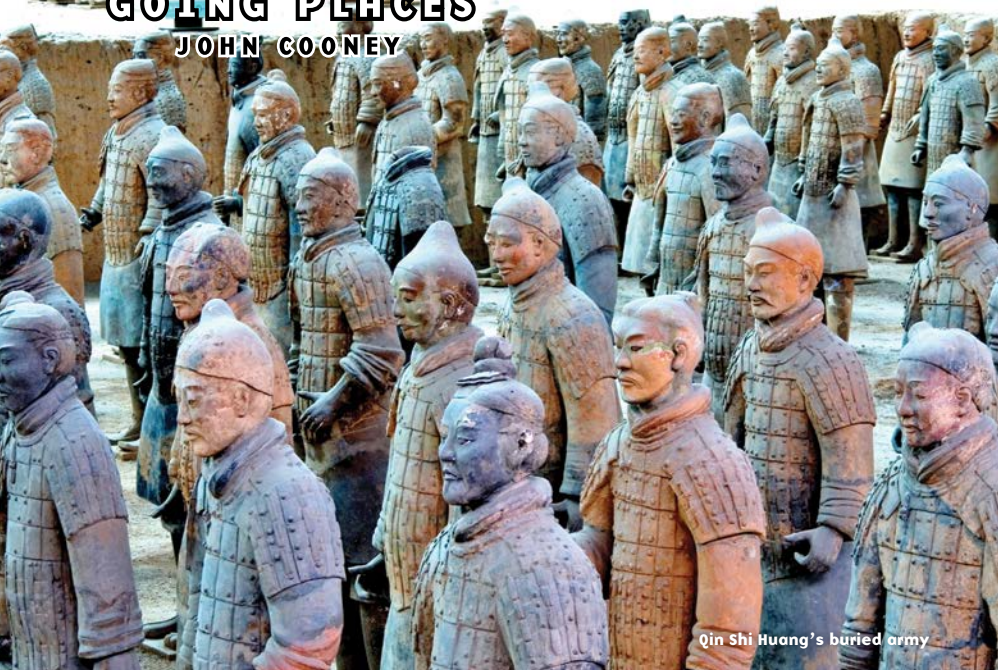
Qin Shi Huang's buried army