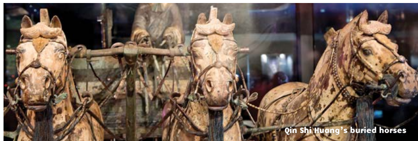
Qin Shi Huang's buried horses

The Great Pyramids were built for a trio of pharaohs (father-son-grandson) who reigned some 4,500 years ago. According to Egyptologists, the mummy of each ruler (after he'd died, of course) was carried in solemn procession across